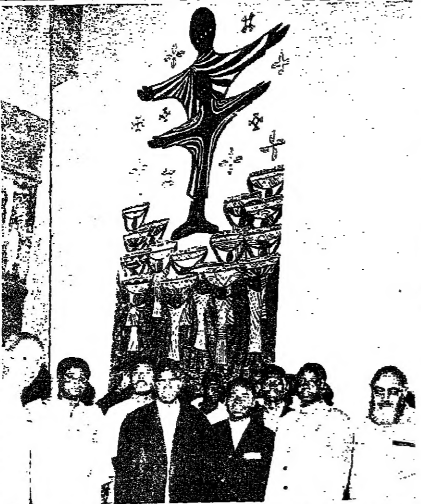
Delegates at the Bible Congress 'Black Africa and the Bible'... seen beneath a mosaic designed by the Rev. Prof. E. Mveng of the Cameroon...

By DEVORAH EMMET WIGODER PORTIONS of the Bible have been translated into almost 450 African languages and no fewer than 172 million copies of the Scriptures have been distributed in African countries since 1970.